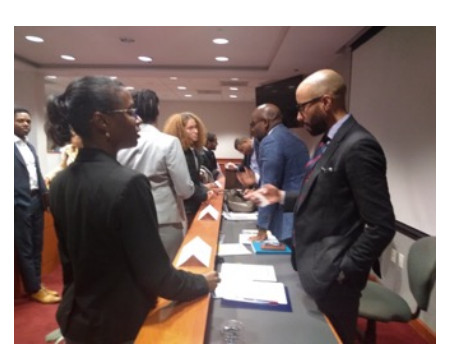
1-r: Expo participants, panelists

The panelists described their individual international career paths to the Expo participants. Those in attendance also had opportunities to consult with representatives of nine exhibitors: US Peace Corps; the Johns Hopkins University School of